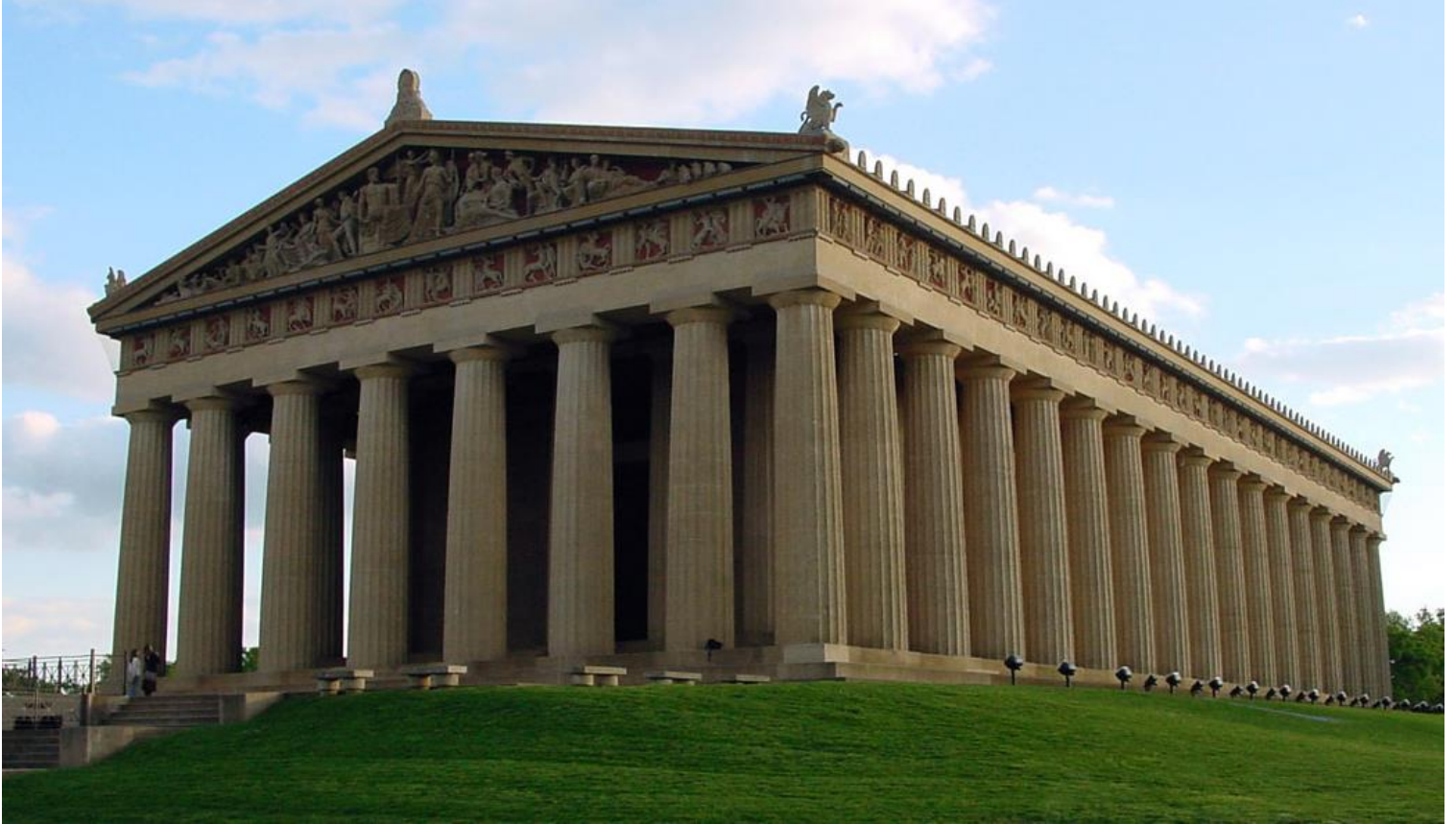
Parthenon at Centennial Park

The deadline to register for the conference with the AOC is Friday, January 22, 2016.