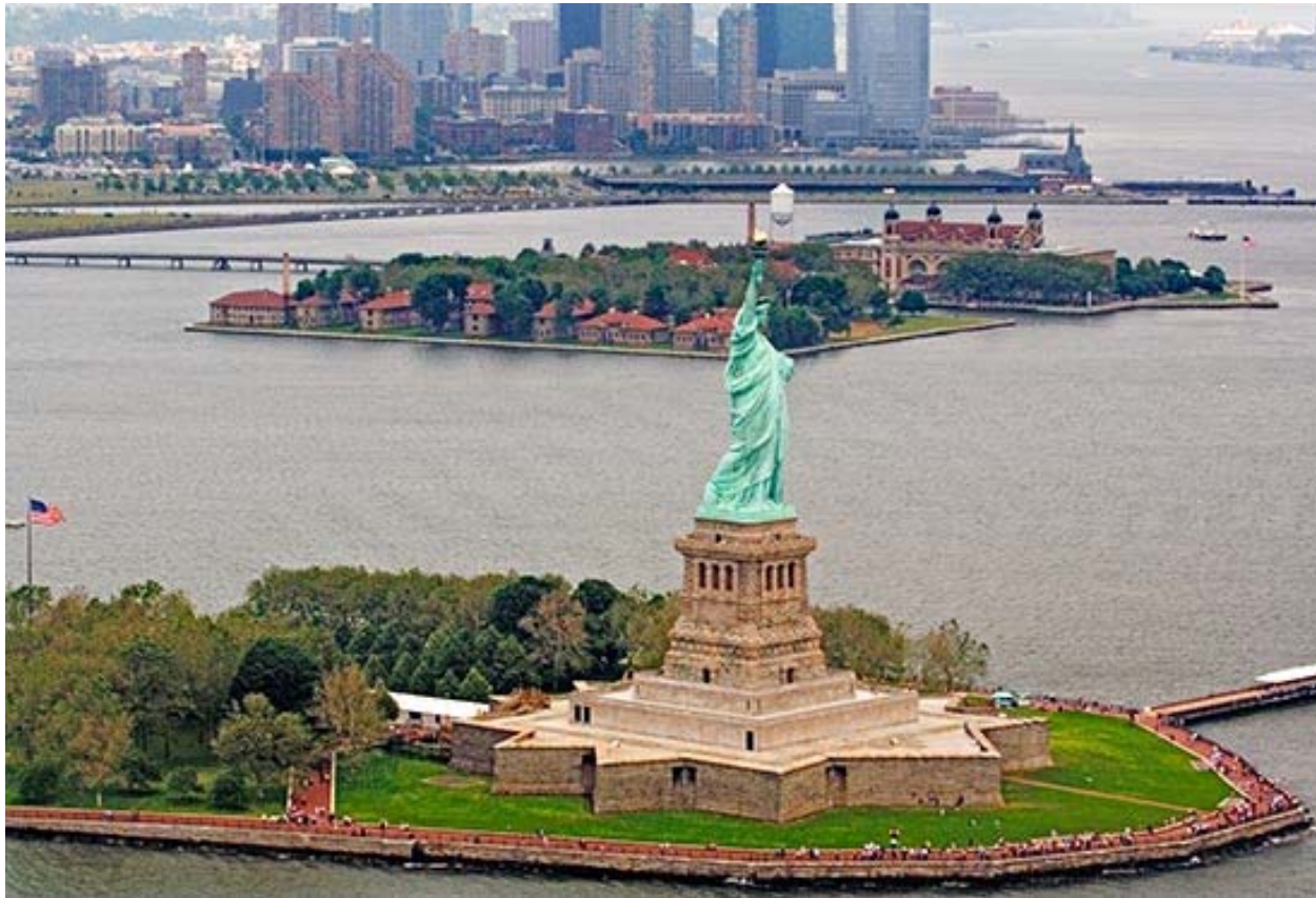
Statue of Liberty and Ellis Island